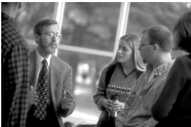
The 14:1 student/faculty ratio affords students an ideal learning environment.